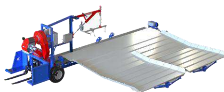
G-004 PRO Automatic